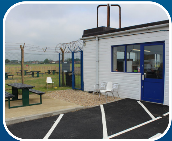
Café @ 05