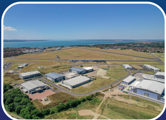
New road network and supporting infrastructure