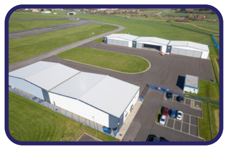
5 GENERAL AVIATION HANGERS