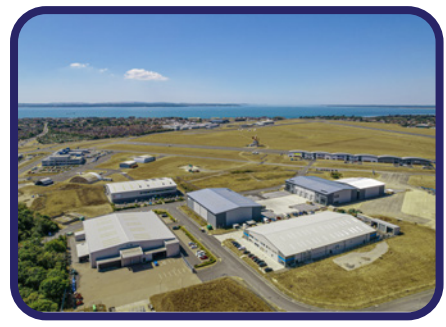
PURPOSE-BUILT BUSINESS UNITS