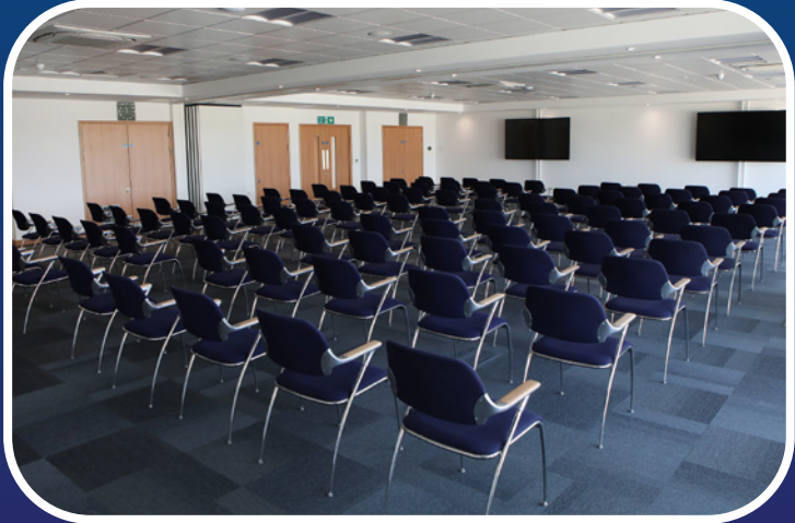
The Bridge Conference Suite...