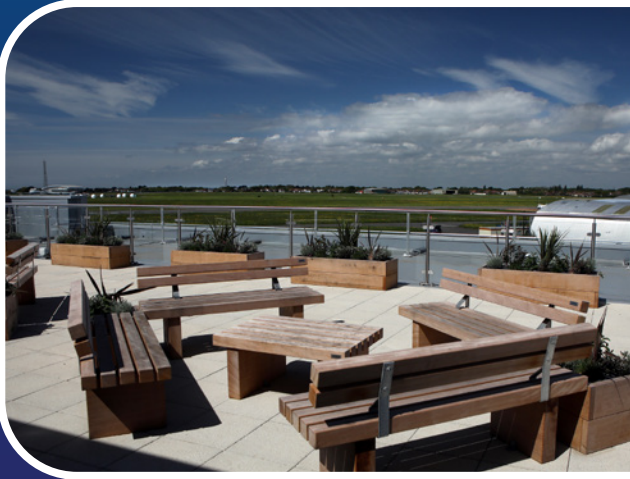
.. features an outdoor terrace