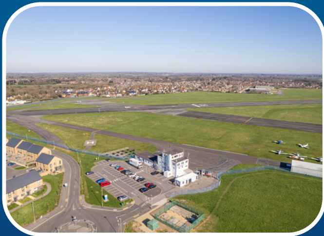
Control tower and runway improvements