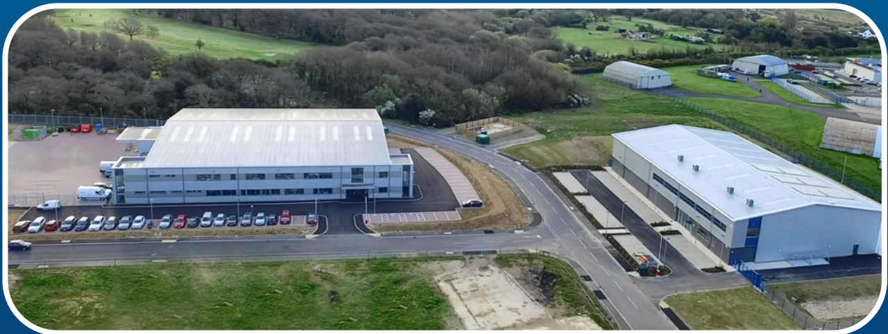
UTP (left) and Proptech Aero (right)