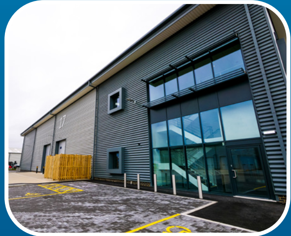
New speculative units completed in 2022