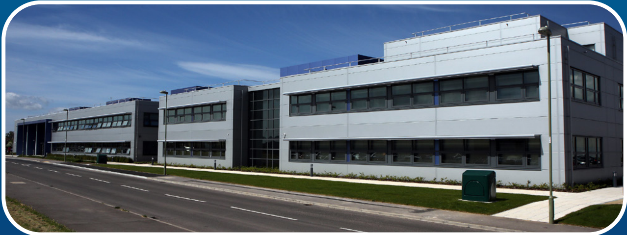
Fareham Innovation Centre extended in 2018