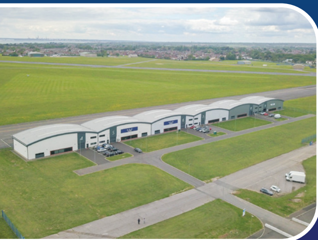
Six new hangars completed in 2018