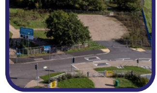
SECURE GATED ENTRANCE