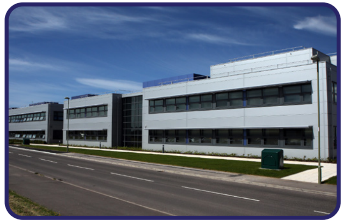
FAREHAM INNOVATION CENTRE